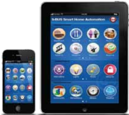
IPHONE & IPAD